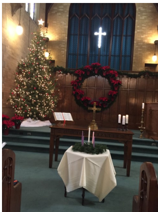
Sanctuary decorated for Christmas

Cheryl Paskett shared some photos taken at events prior to the CoVid-19 shutdown: